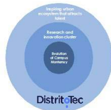
Figure 1: Levers of transformation

that promotes research, innovation, learning and entrepreneurship; b) an emerging research and innovation cluster that will attract talent and create value; c) an urban revitalization process that will create the conditions for an attractive and inspiring urban environment (figure 1).